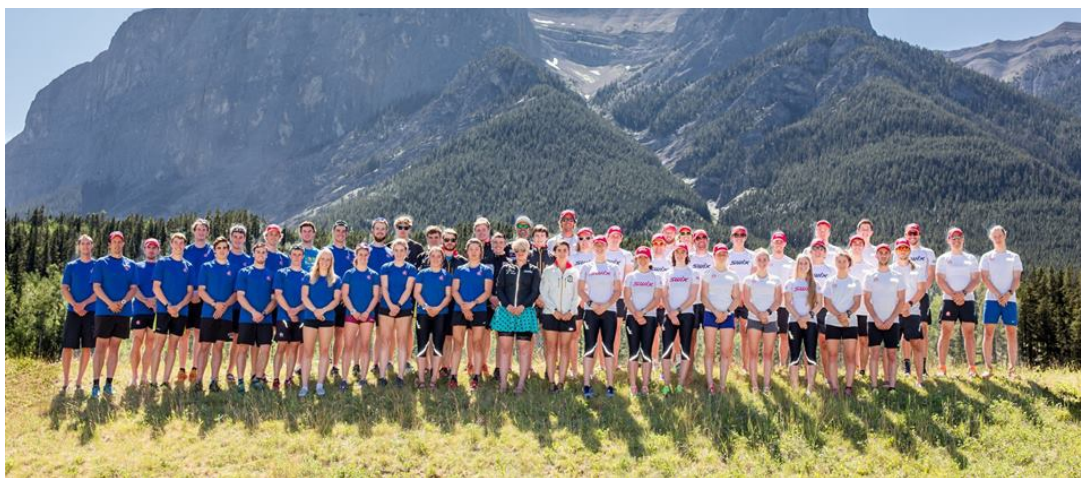
A group photo at a joint training camp between NDC Thunder Bay, AWCA, CNEPH and the National Team.

Somewhere between CCC and the Provincial Sport Organizations, you have us, the training centres. Training centres are development programs that CCC helps to fund as part their effort to produce international calibre athletes. Training centres are for athletes who want to pursue cross country ski racing at a high level and are striving for national and international success. At the end of each season, the training centres sit down with CCC to decide which athletes get named to which centres. Each of the teams have met criteria defined by CCC as to what their program needs to deliver, and how the organization has to be run. Currently there are 3 training centres in Canada: the Alberta World Cup Academy, based in Canmore, the Centre Nationale d'Entrainement Pierre Harvey, based in Quebec City, and NDC Thunder Bay (that's us!) based out of Thunder Bay, Ontario.